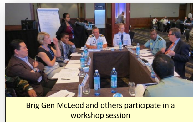
Brig Gen McLeod and others participate in a workshop session