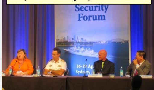
Biosecurity panelists respond to questions during Day 2 of the PESF