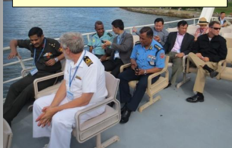
Participants aboard the Sydney Harbor Defense Facilities tour