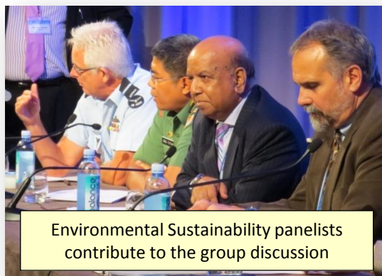
Environmental Sustainability panelists contribute to the group discussion